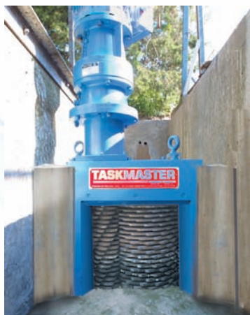
The TITAN's cutters powerfully reduce wastewater solids while allowing fluids to pass through freely.

Large Throat Opening Handles Larger Solids | High Flow Capability Rugged and Durable | Low Headloss | Fine Output | No Diverter Screens